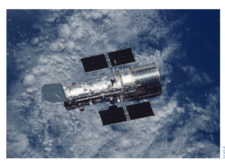
These days there are observatories on all seven continents and in space. While the <u>Hubble Space Telescope</u>'s days may be numbered, other space-based scopes are either in orbit (<u>Spitzer Space Telescope</u>) or on the way (<u>James Webb Space Telescope</u>).

With so many papers appearing daily, how do you make other astronomers aware of your work and get them to cite it? One solution is to tell them what you do by presenting seminars in