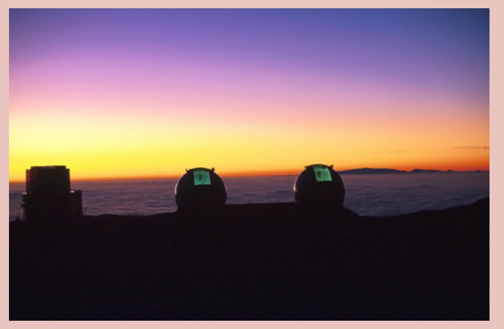
How would you like to work here?

Attributes of a good PhD student include a passion for research, a high level of motivation, well organized, and good verbal and written skills. As a student you will probably be working more than 40 hours a week (think apprentice), so it's important to work efficiently.