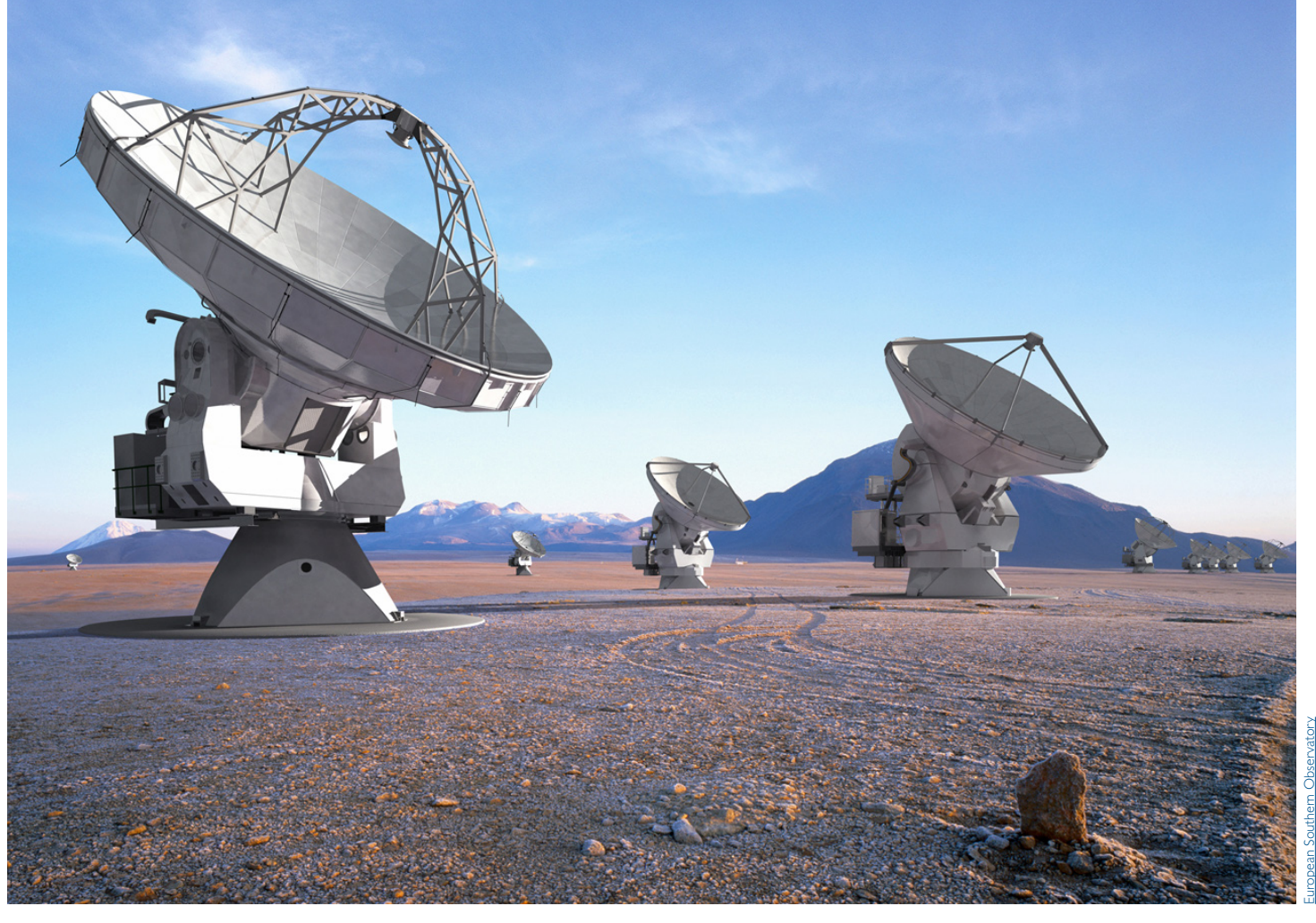
There are a number of new major observatories being planned or currently under construction, including the Atacama Large Millimeter/submillimeter Array (ALMA) in the Atacama Desert of northern Chile. While astronomy isn't a growth industry, there are still plenty of opportunities for eager researchers.

You'll have a better grasp of the big picture but probably at the expense of the technical details. Choosing your collaborators well is an important aspect of ongoing research success. You will increasingly multi-task, juggling teaching, community service, administra-