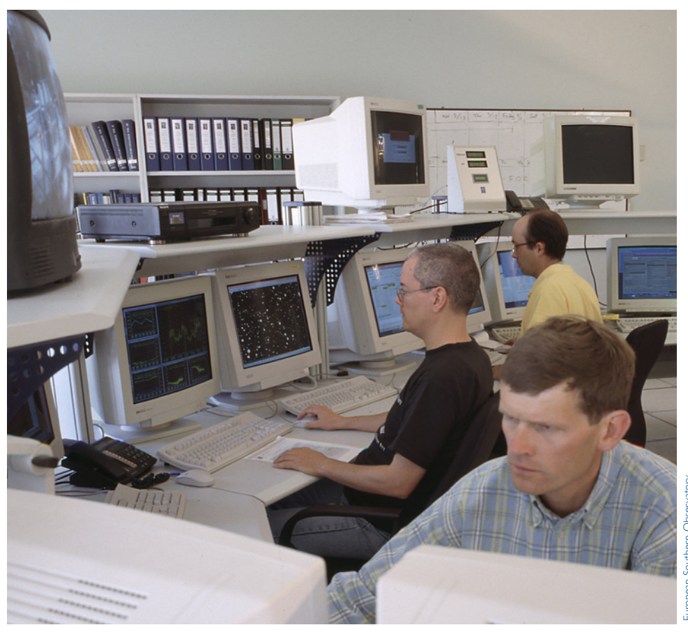
As a professional optical astronomer, you'll probably never look through the eyepiece of a large telescope. Instead, you'll spend your time manipulating instruments and "observing" from inside control rooms like this one. Some observatories even offer remote-observing capabilities that let you observe from the comfort of your own office.

So generally speaking there is a postdoc position in astronomy